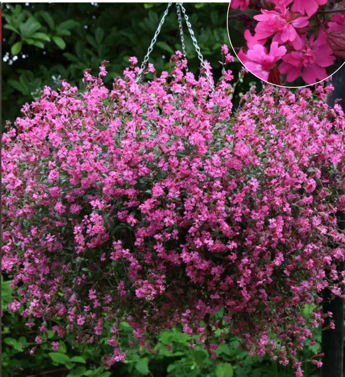
Sibella Carmine, a stunning colour spark for spring and summer

Looking for a vibrant colour blotch to brighten up your garden? Get acquainted with Sibella Carmine! This brand new Silena pendula is a multifunctional colour blast for pots, containers and bedding. Sibella makes large plants that are just perfect for baskets and containers in spring or ideal as an all-round bedding and terrace plant in summer. The plants are self-cleaning, flowers do not scatter and no deadheading is needed.